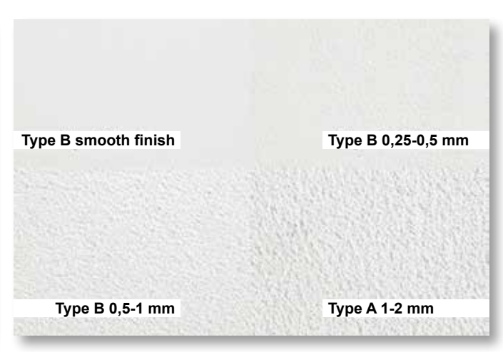
Grain size of the various finishes