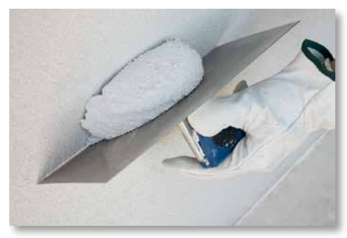
Applycation using a smooth-edged trowel

Afontermo® can be painted using Thermopittura Afon casa Fore more details regarding the application see the technical datasheet.