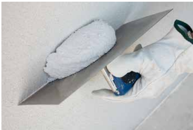
Application using a smooth-edged trowel

Afontermo® can be painted using Pittura thermo fotocatalitica Afon casa For more details regarding the application see the technical datasheet.