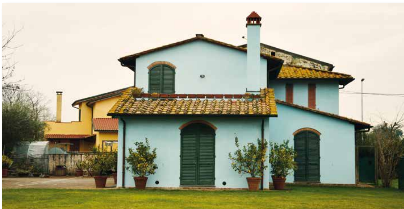
PISA: Facade treated with Afontermo®