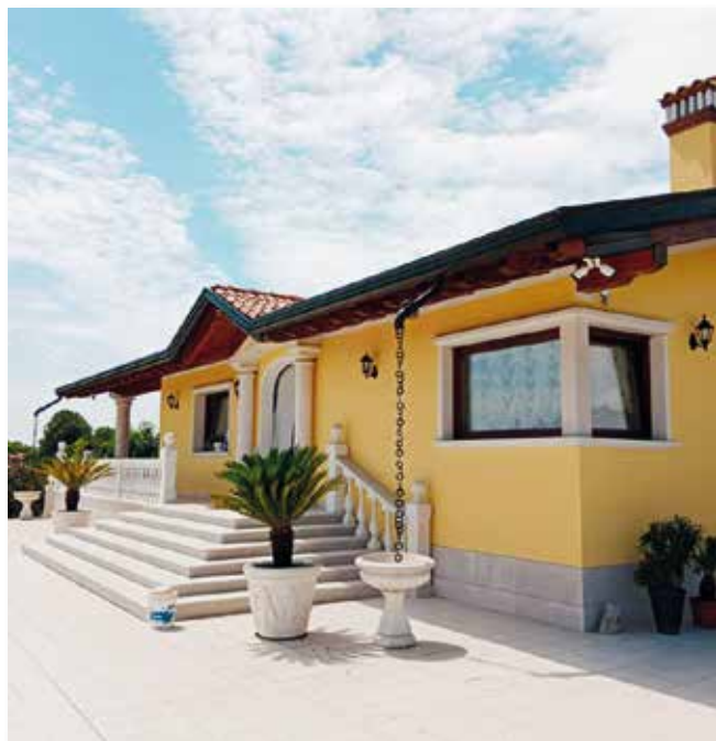
PORDENONE: Facade treated with Afontermo®