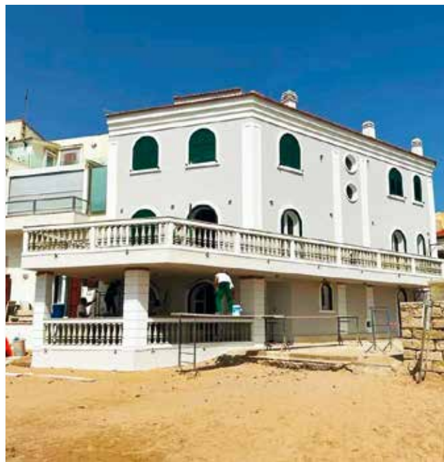
THE HOUSE OF "MONTALBANO" (RG): Facade treated with Afontermo®