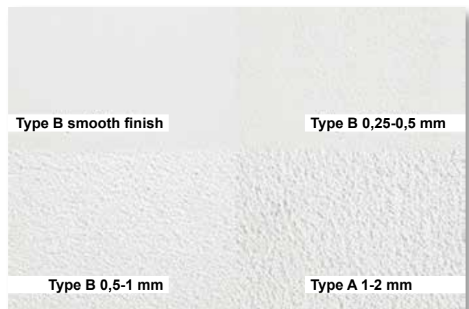
Grain size of the various finishes