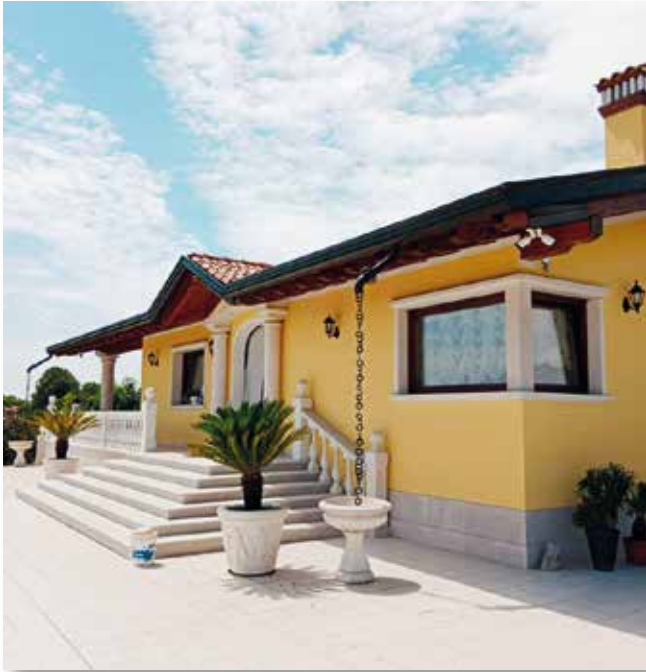
PORDENONE: Facade treated with Afontermo®