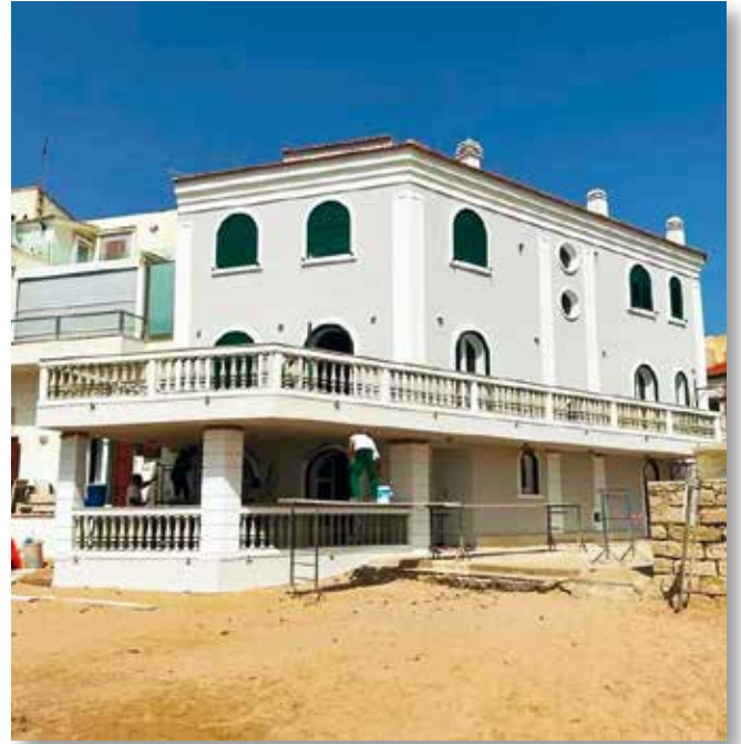
THE HOUSE OF "MONTALBANO" (RG): Facade treated with Afontermo®