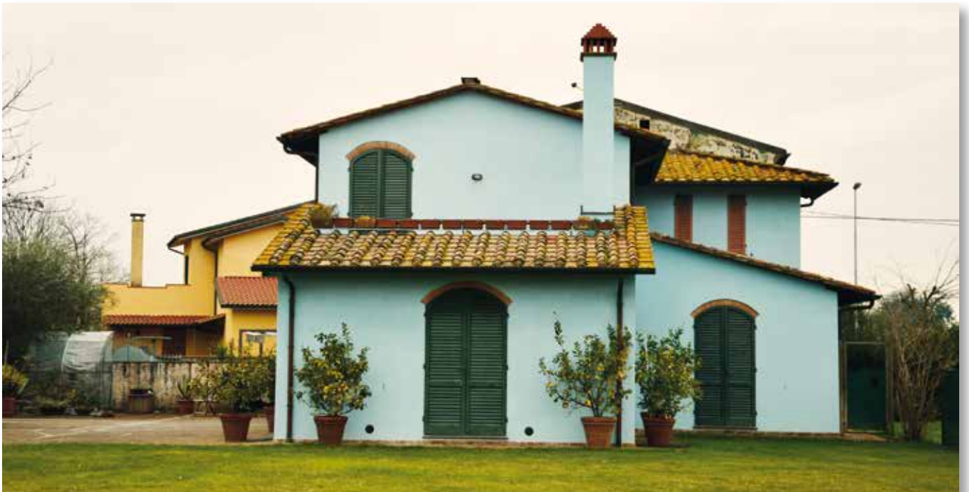
PISA: Facade treated with Afontermo®